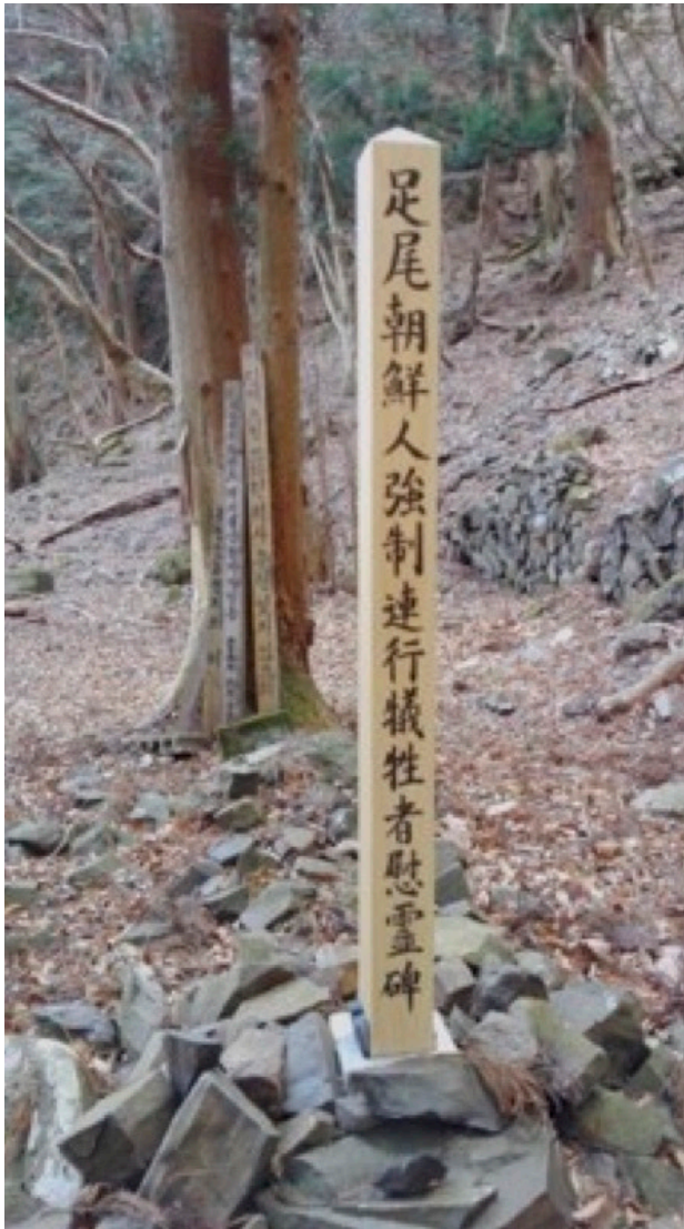
Figure 1: Memorial for Korean laborers at the Ashio copper mine.

sareta rōdō (“labor that was forced”)? In the end, the Japanese government acknowledged that Chinese and Korean labor “was forced” to work at these sites during the war, and the UNESCO committee voted to designate these facilities as World Heritage Sites.